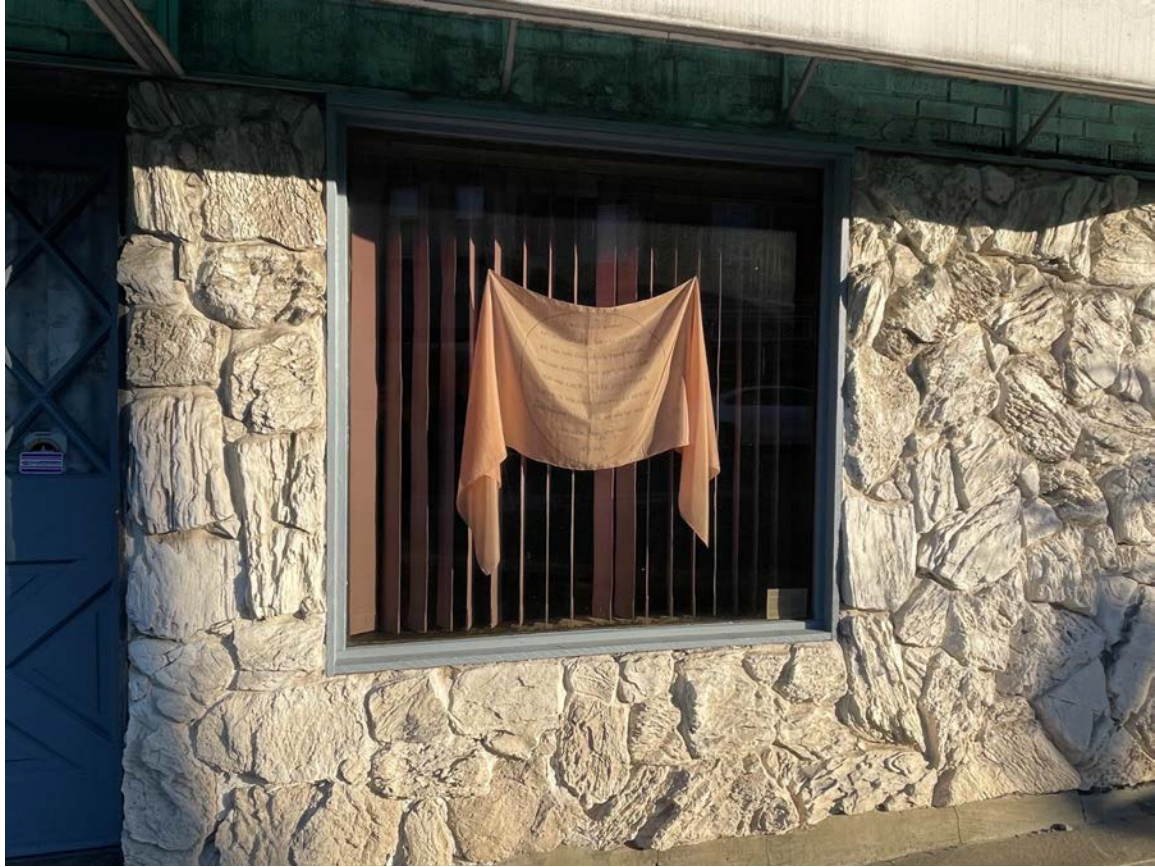
Louise Bourgeois' work She Lost It (2) in Former Beauty Salon 1723 Lowrie St.