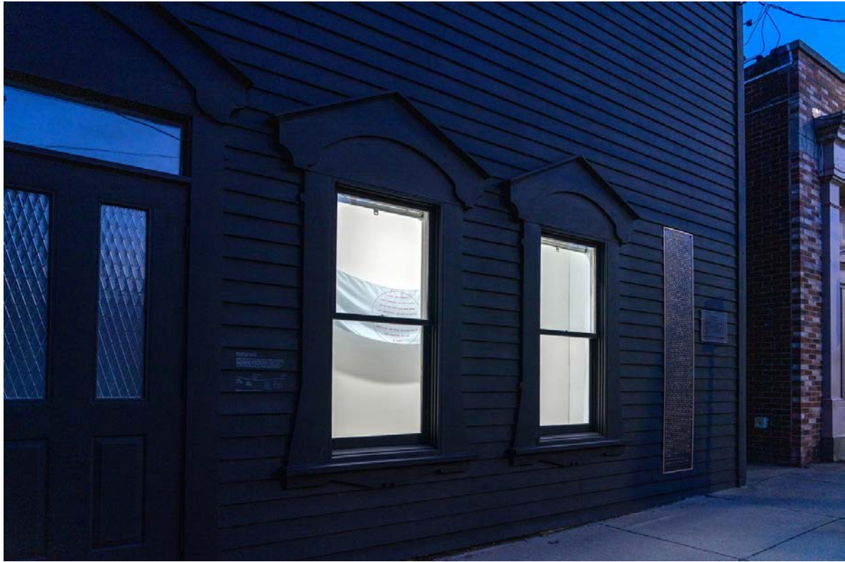
Louise Bourgeois' work She Lost It (2) in Gallery Closed 1733 Lowrie St.