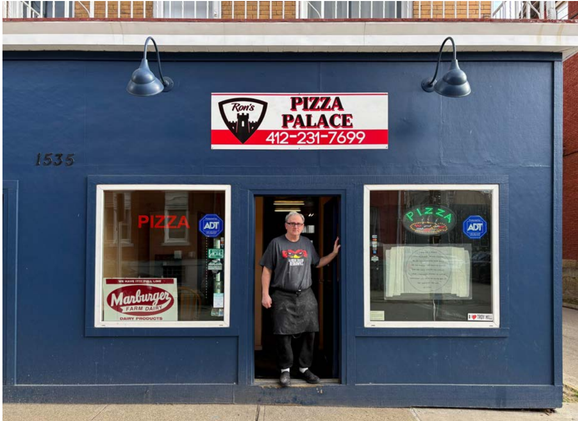
Louise Bourgeois' work She Lost It (2) in Ron's Pizza Palace 1535 Lowrie St.